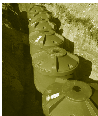
Above, top: The SmartStorm Rainwater Recovery System, developed by the Charles River Watershed Association; the cisterns and pumps can be easily hidden by landscape plantings.