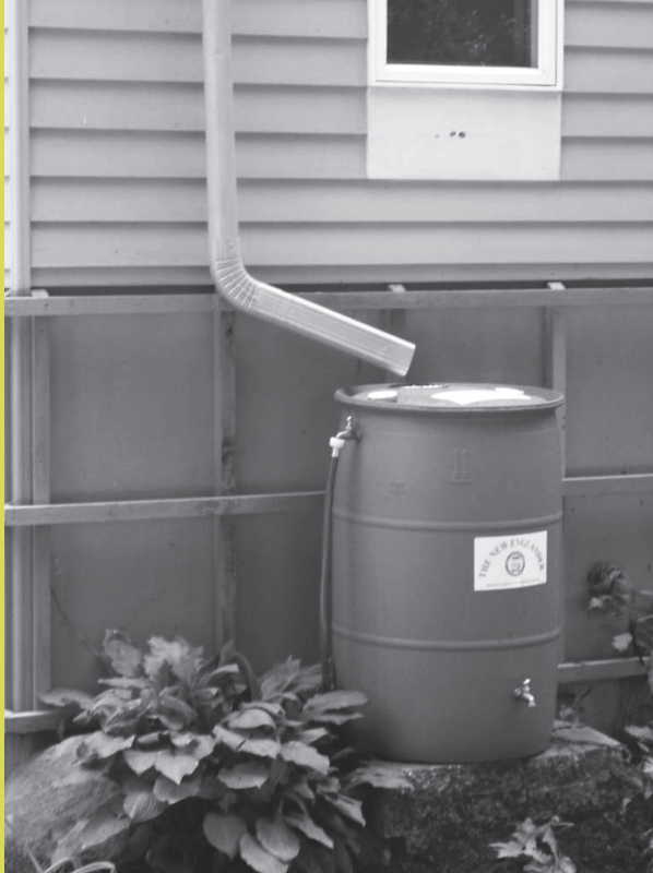
The overflow outlet from this rain barrel drains into an adjacent rain garden.

reduce the demand for potable water for landscaping and irrigation. The cost-benefit ratio will depend on how much landscaping/irrigation water the property owner uses, and the unit cost of water from the local public water supply.