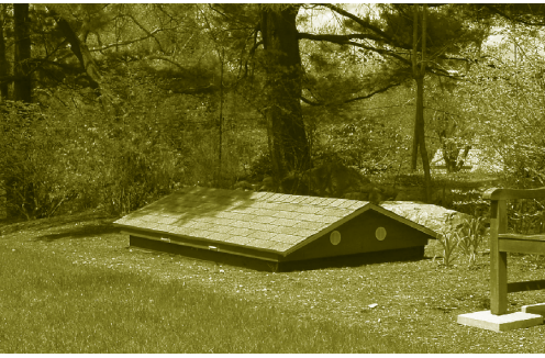
Above: A low-profile cistern "head house" opens to reveal the electric pumps that distribute water throughout this residential property.