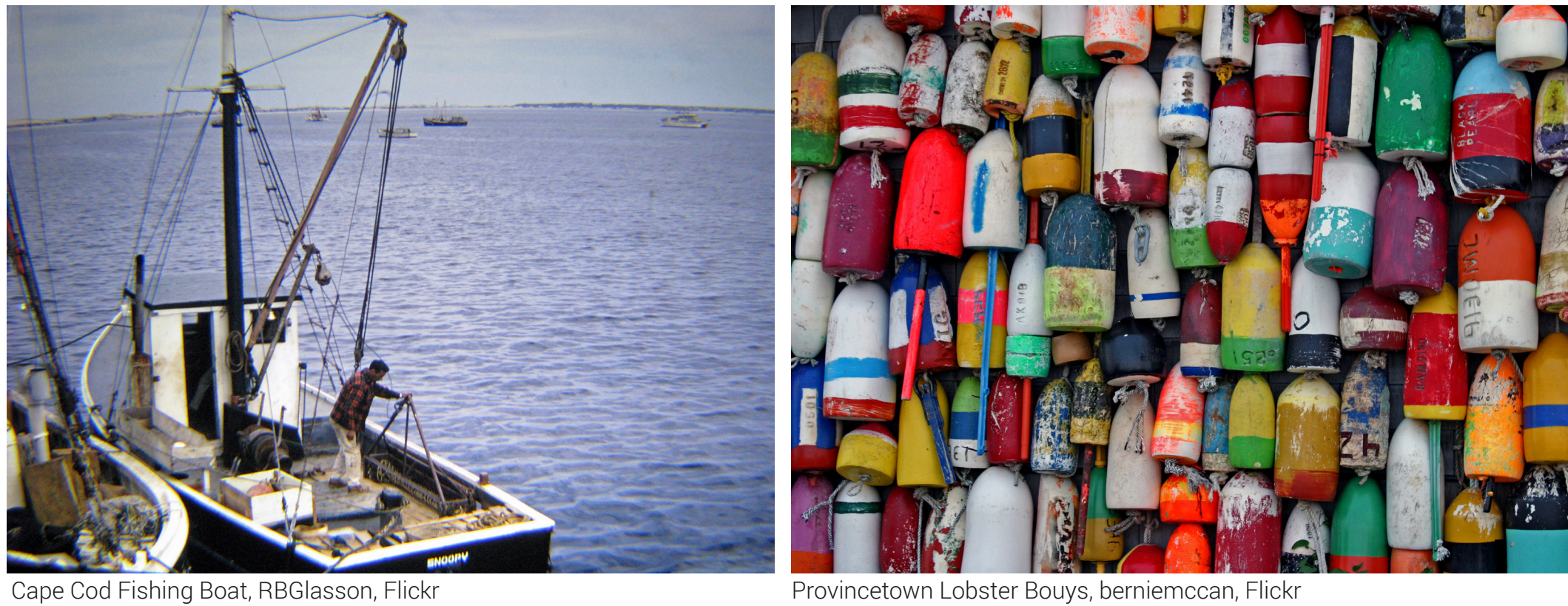
Cape Cod Fishing Boat Provincetown Lobster Buoys

In 2009, Massachusetts adopted a first-in-the-nation Ocean Management Plan . The Ocean Plan is a framework for managing the state’s marine waters in the face of growing economic, environmental and recreational interests. The planning area includes more than 2,000 square miles of ocean. 3 The plan delineates a wide variety of resources within this area—fisheries, commerce, recreation, wildlife, and geology—and designates distinct zones of development.