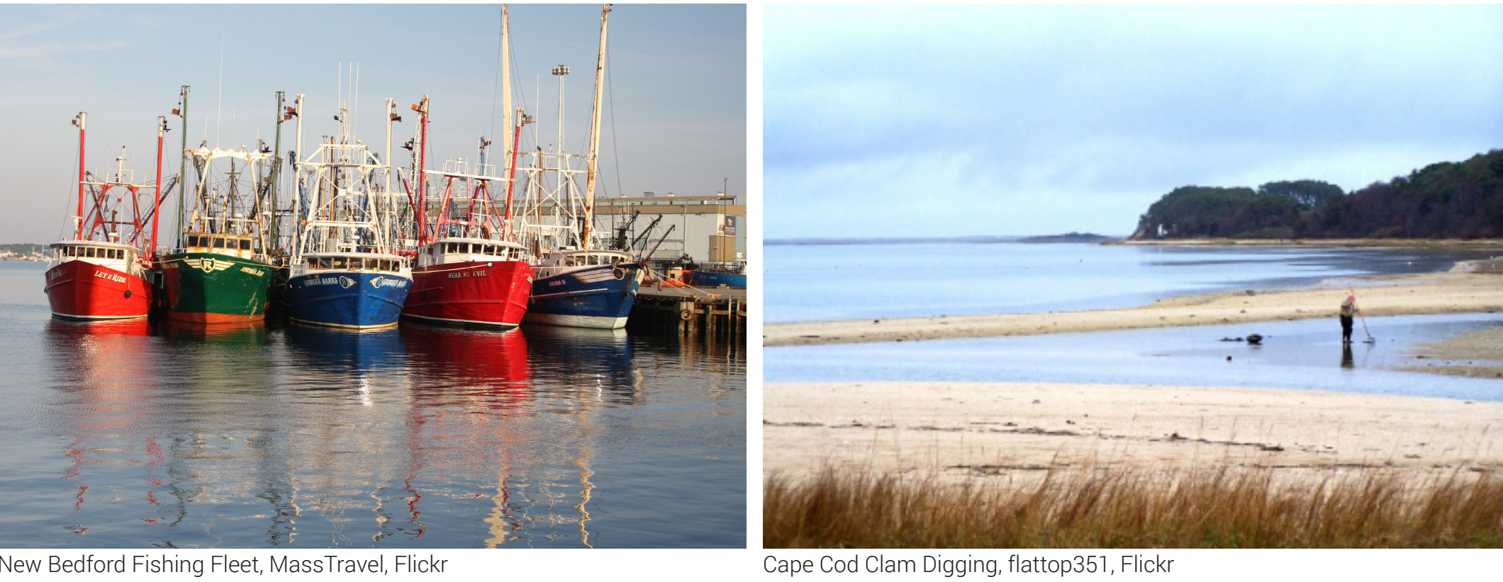
New Bedford Fishing Fleet