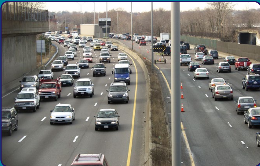
Connected and Autonomous Vehicles and the Boston Region MPO—A First Look— bostonmpo.org/autonomous-vehicles-first-look

Past studies are available in our Publications Archive at bostonmpo.org/recent_studies .