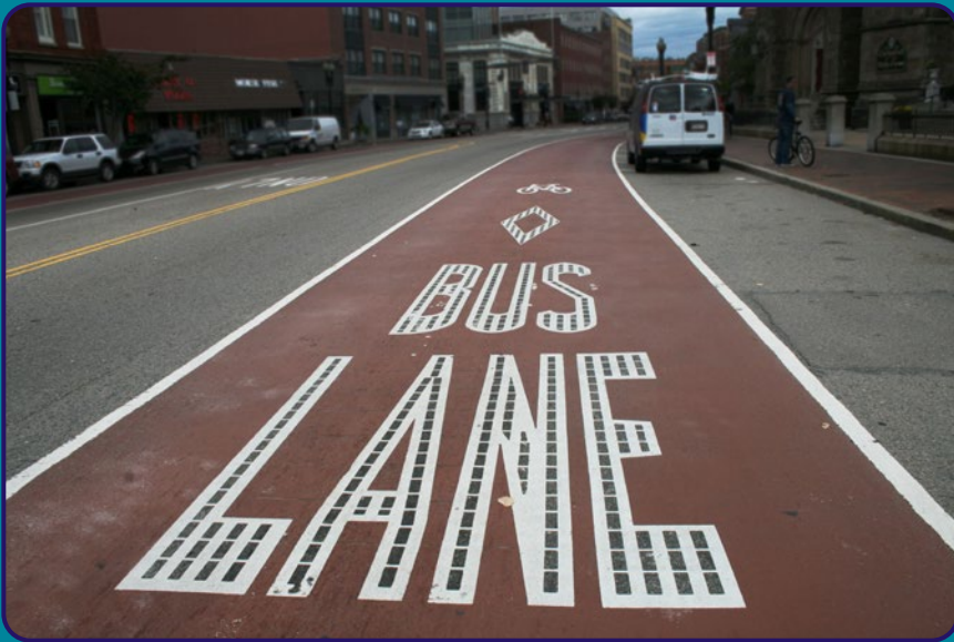
Prioritization of Dedicated Bus Lanes— bostonmpo.org/prioritization-of-dedicated-bus-lanes