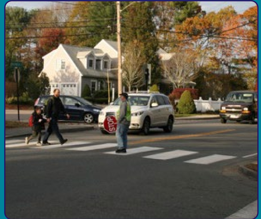
The Safe Routes to School Program: Progress and Opportunities— bostonmpo.org/srts-progress-and-opportunities