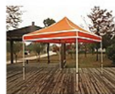
Temporary outdoor structures and accessories