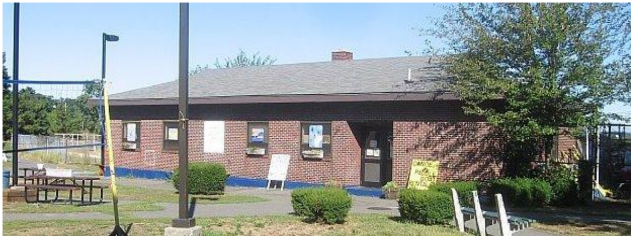
The Blessing of the Bay Boathouse

Critical improvements at the Boathouse were designed to improve the accessibility and visibility of the site. New handicap accessible ramps provide access to the parking lot and to the Boathouse, and additional lighting was added to further increase the site's safety. A new floating dock that rises less than a foot above the water makes boating safer and easier. New signage was added to highlight the Boathouse and the resources of the Mystic River. Enriched community programming at the Boathouse will complement the physical improvements and encourage people to find new ways of using the boathouse and experiencing the Mystic River.