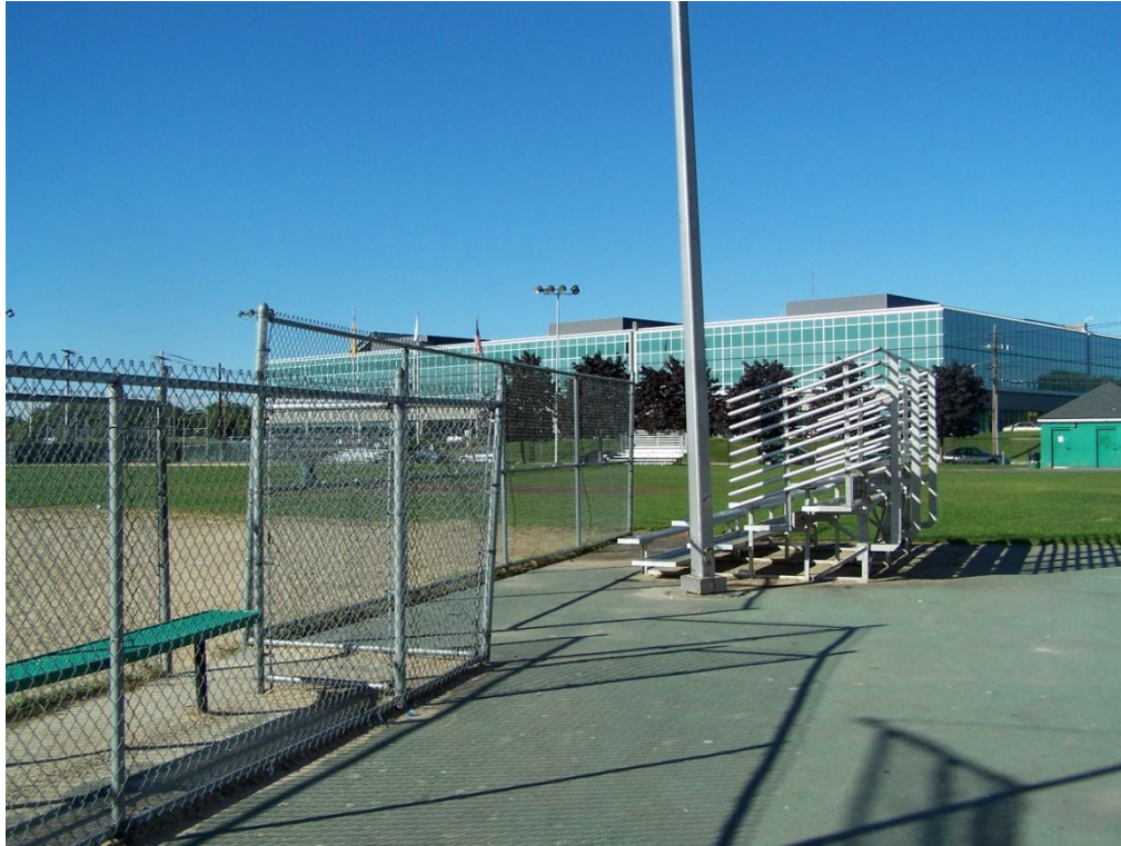
Figure 3 Sacramone Park with Mellon Bank in the background