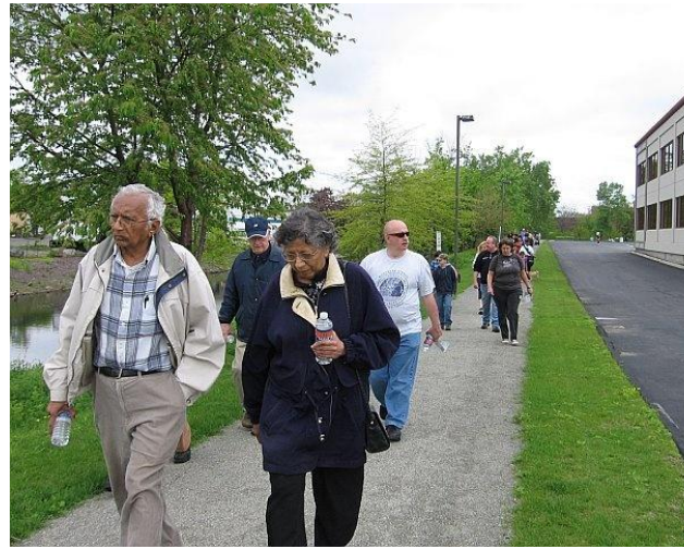
The Malden River Walk