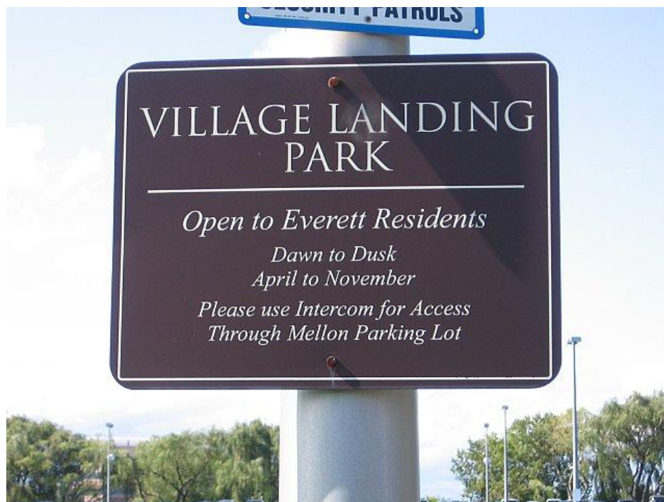
Figure 4 The Village Landing Park sign