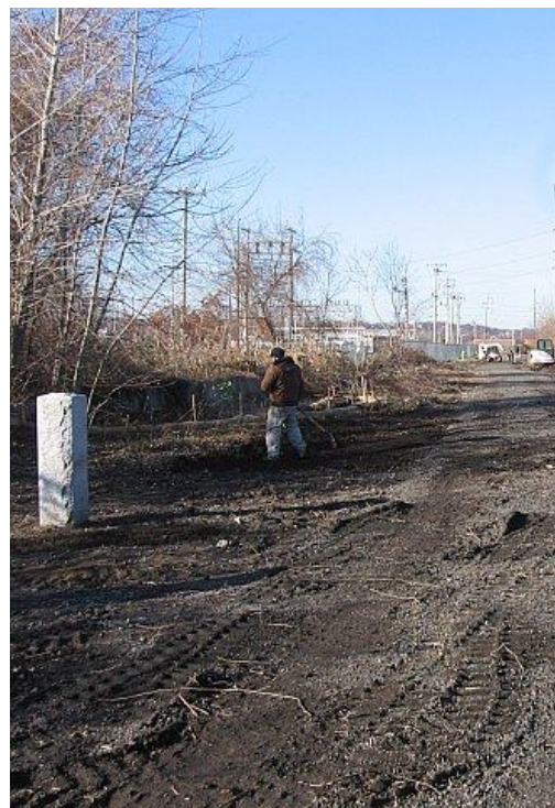
The first mile of the Northern Strand Community Trail under construction