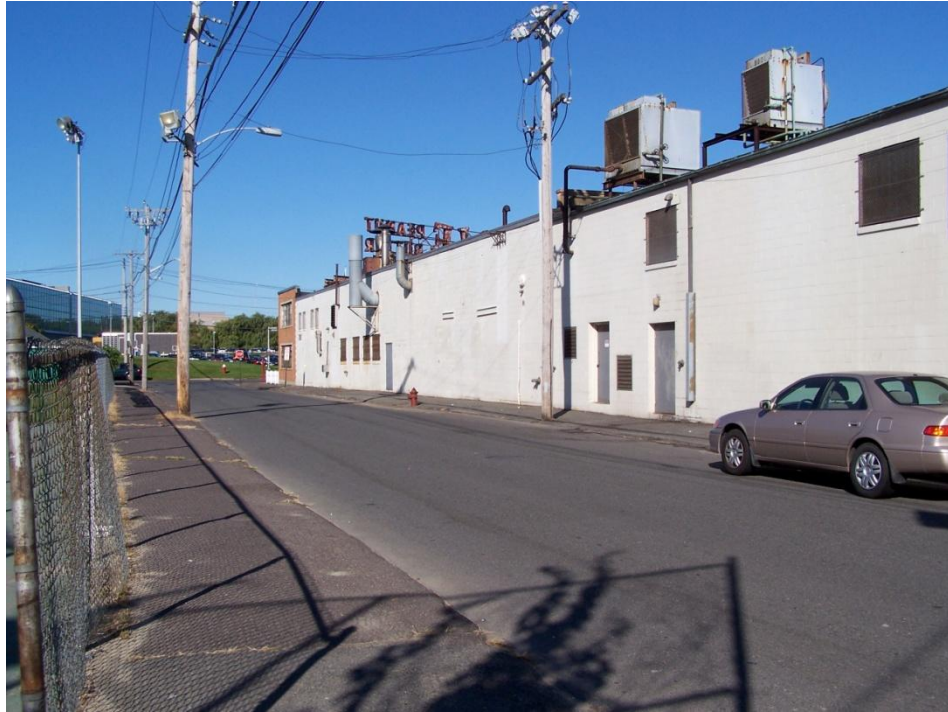
Figure 1 Tileston Street with Sacramone Park to the left