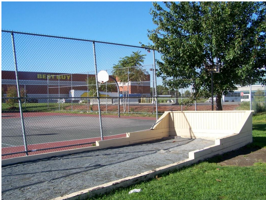
Figure 2 Sacramone Park looking towards Best Buy