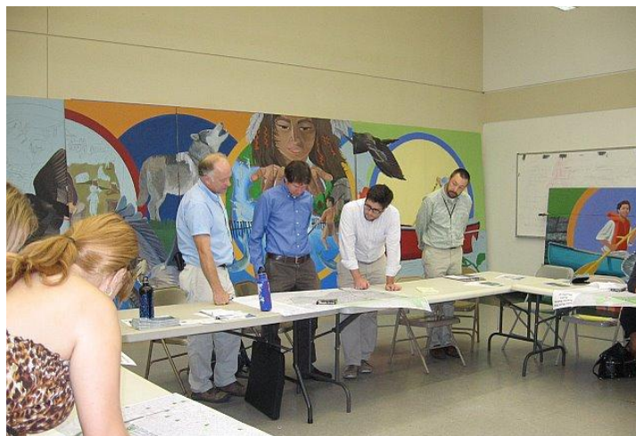
Workshop participants mark maps with potential routes

b) Brainstorm potential routes – In order to brainstorm potential routes it is important to get a wide variety of people sitting around the map and exchanging ideas. This group should include, but not be limited to, municipal planning and community development staff, bicycle and pedestrian advocates, health and fitness organizations and advocates, DPW and transportation staff, school department representatives and parks and recreation staff.