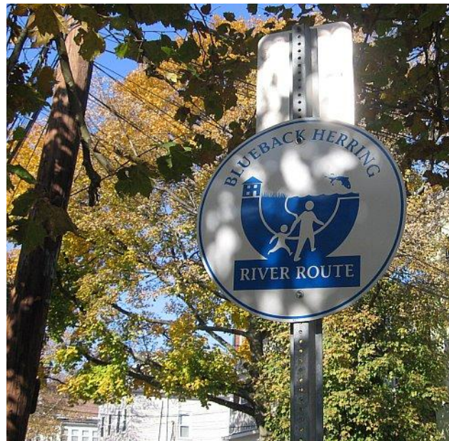
The Blueback Herring River Route