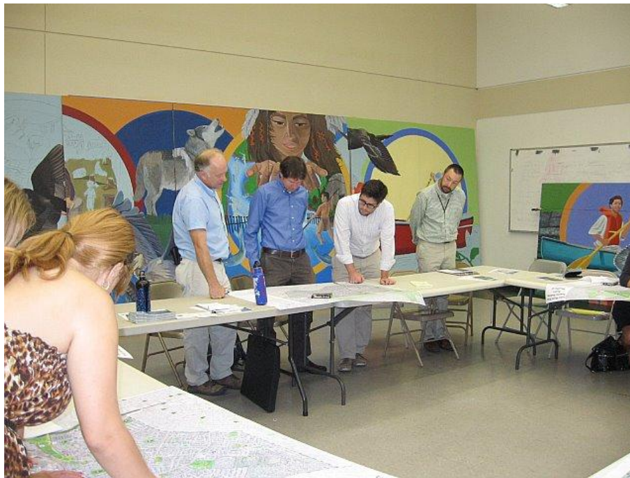
Workshop participants mark up maps with potential routes

MAPC held a workshop on September 15, 2011 at the Mystic Activity Center in Somerville. The workshop was attended by community representatives from Chelsea, Everett, Medford, Malden and Somerville and representatives of a variety of local organizations. At that meeting, participants marked up maps with potential walking routes for further evaluation.