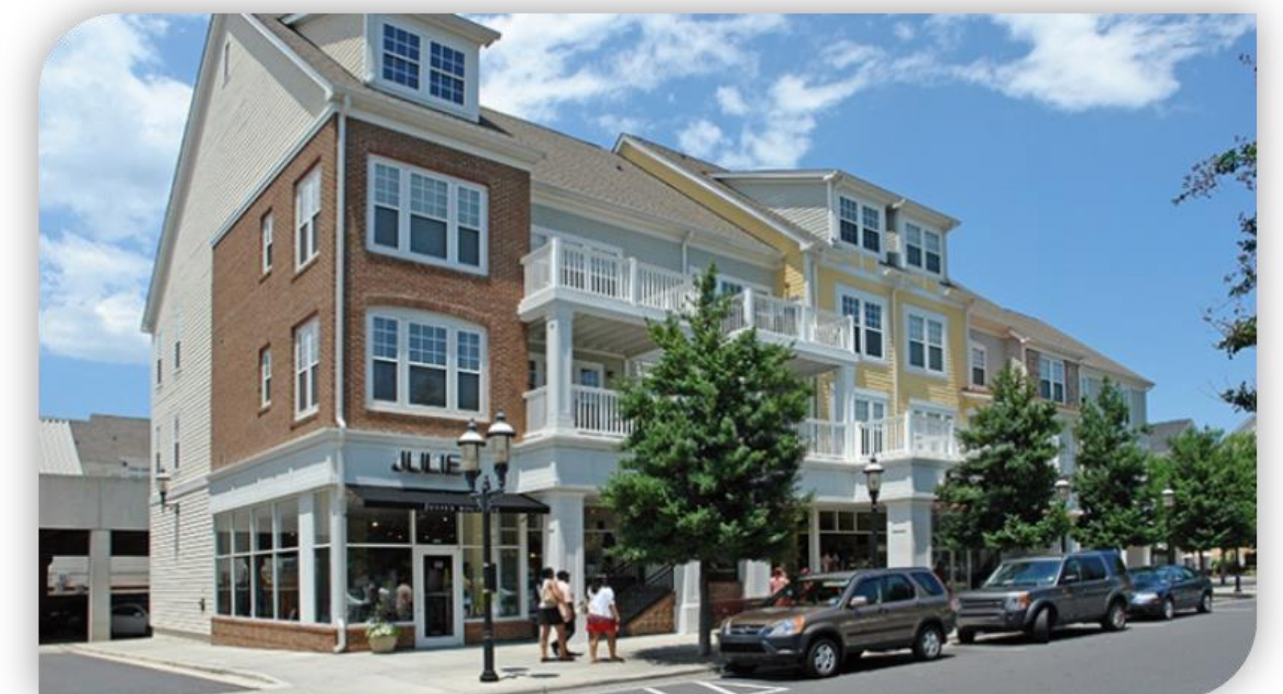
RESTAURANTS & MIXED-USE/RESIDENTIAL REQUIRE MORE TREATED GALLONS PER DAY