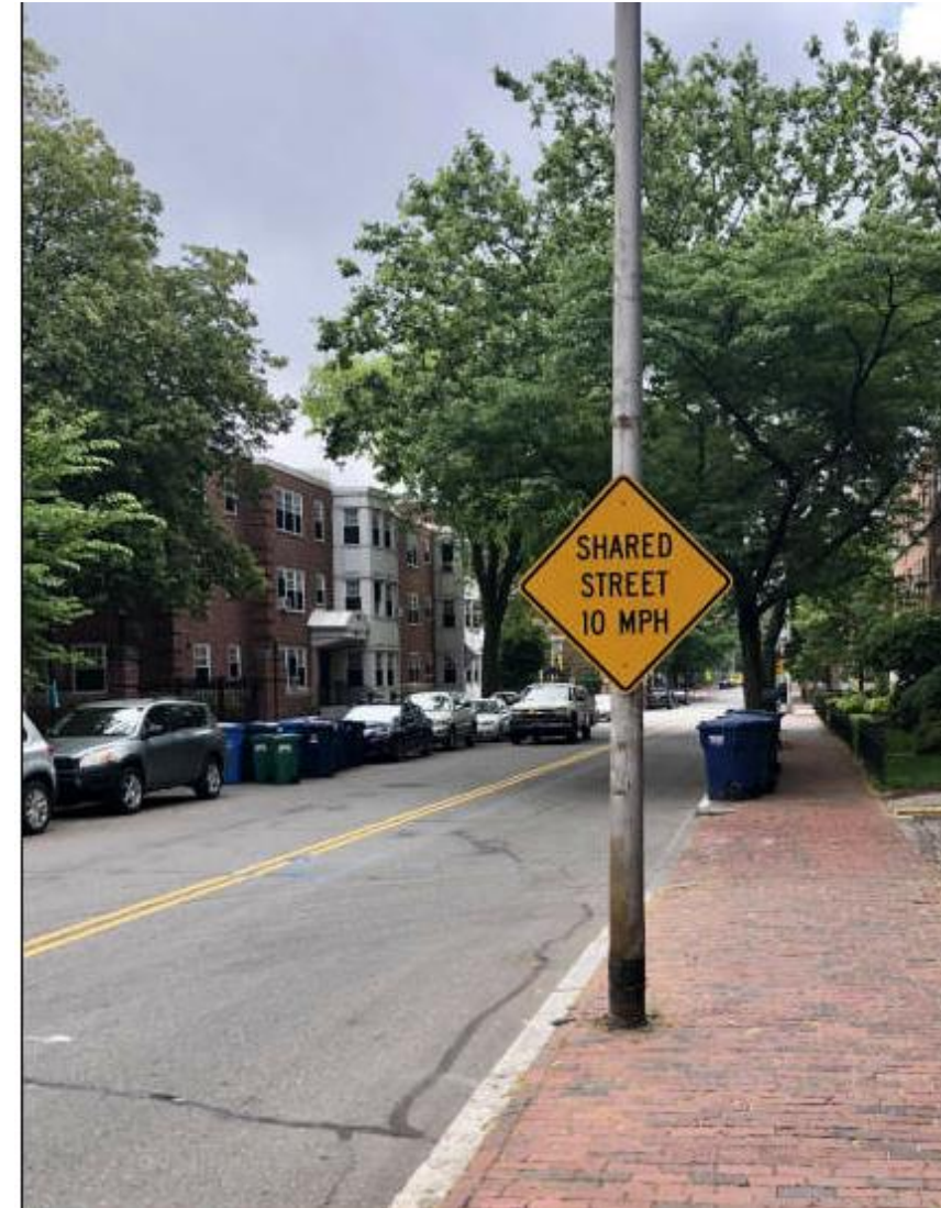
SHARED STREETS: Left: Brookline, MA; Middle Top: Arlington, MA; Middle Bottom: Lexington, MA; Right: Cambridge, MA