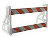
Posts, channelizer cones Traffic barricades