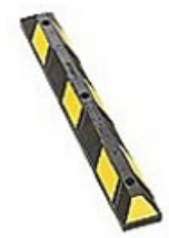
Parking curbs and speed bumps