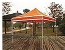
Temporary outdoor structures and accessories