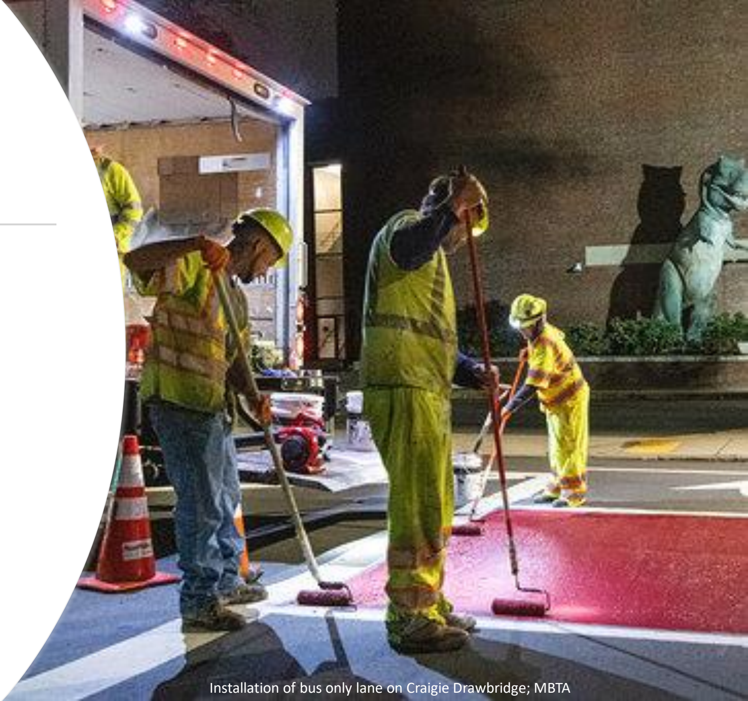
Installation of bus only lane on Craigie Drawbridge; MBTA

Solomon Foundation – Streets for Recovery