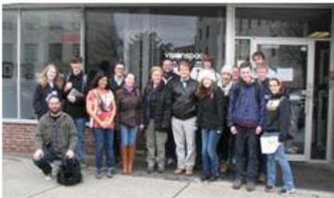
Downtown Lynn Data Walk participants pose for a group photo outside Centerboard in City Hall Square.

On Saturday, April 13, 2013, the MAPC project team invited volunteers to assist with the Downtown Lynn Data Walk.