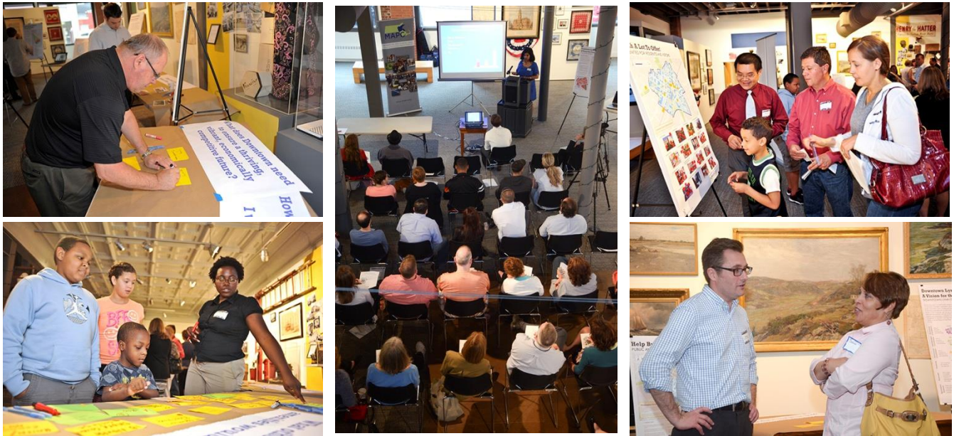
from the May 23, 2013 Open House and Public Forum held at the Lynn Museum.

Community Engagement was a critical component of MAPC's efforts to build on the vision for Downtown Lynn. We learned about Downtown Lynn and its needs by convening a project Team of Advisors, conducting interviews with community leaders, giving presentations to community-based organizations, attending community events, talking with people we encountered on the street or at local businesses, interacting with community members using social media such as Facebook as well as via email, collecting land use and property data using local volunteers, and by hosting two public forums in Downtown. We know we did not meet everyone with something to share about the future of Downtown Lynn, but our hope is that this targeted approach gave us an informed perspective to guide our recommendations.