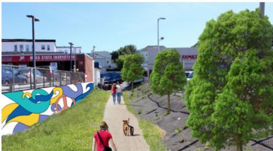
Rendering of Beautification Way once completed

Prior to the installation of the mural, the City had worked with property managers of the adjacent shopping complex to plant eight magnolia trees in spring 2020. A path was paved along the alleyway to create a new connection for people to walk, bike, and roll. This path connected to a paved parking lot used by local employees of the shopping center.