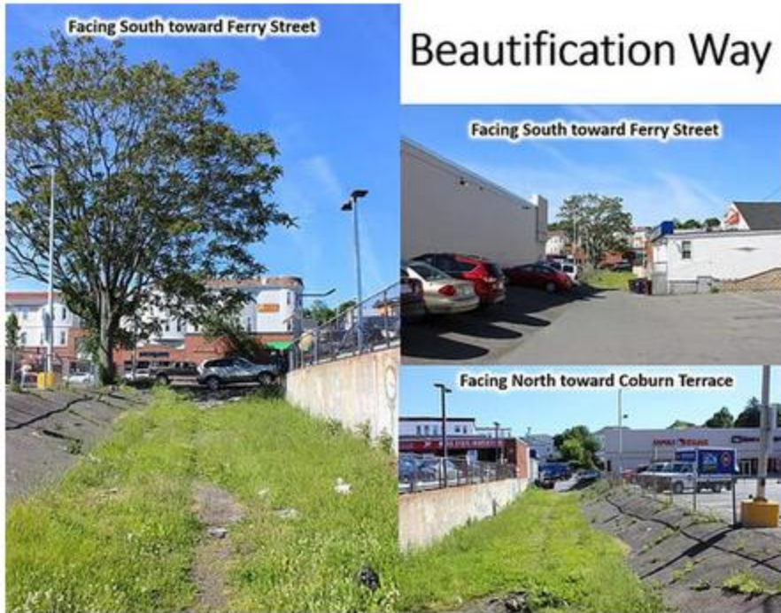
Beautification Way, 2019