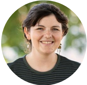
Abbey Judd Arts and Culture