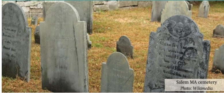
Salem MA cemetery