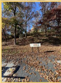
Two Proposed Areas for Monument Placement