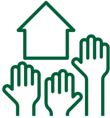
A Housing Shortage

There is a nationwide housing crisis occurring across the United States. While it shows up in different ways in different places, it affects communities of all sizes, demographics, geographies, and income status. Greater Boston is one of the regions in the country where the housing crisis is especially apparent. There are a variety of factors that contribute to the housing crisis, including: