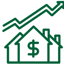
High Cost of Living