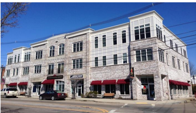
Address: 17-33 East Central Street, Franklin Units: 20 Acres: 0.99 Density: 20 Units/Acre