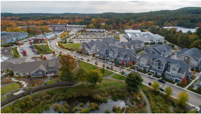
Address: 528 Boston Post Road, Sudbury Units: 250 Acres: 17 Density: 15 Units/Acre