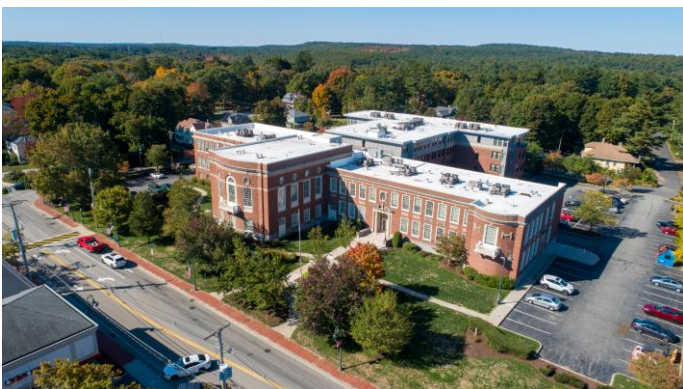
Address: 75 South Main Street, Sharon Units: 75 Acres: 2.9 Density: 26 Units/Acre