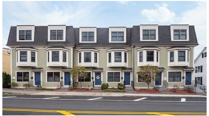
Address: 160 Green Street, Melrose Units: 6 Acres: 0.22 Density: 27 Units/Acre