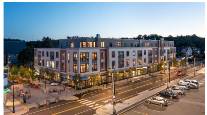
Address: 28 Austin Street, Newton Units: 68 Acres: 1.7 Density: 40 Units/Acre