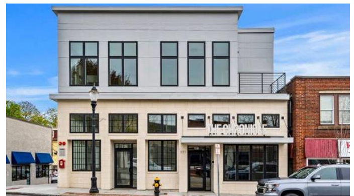
Address: 531 Main Street, Reading Units: 7 Acres: 0.13 Density: 54 Units/Acre