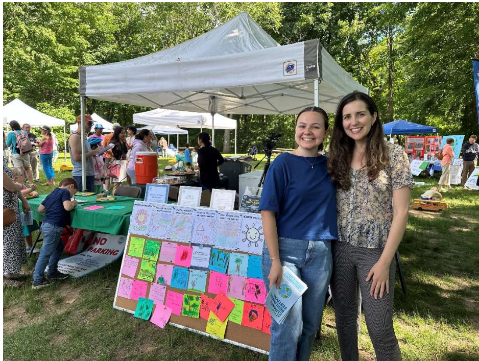
June 8, ActOn Climate Resilience Festival, of two Acton Sustainability Department staff members standing in front of the “Community Resilience Quilt” one of several interactive activities planned with the help of MAPC for MVP 2.0 community outreach and engagement.