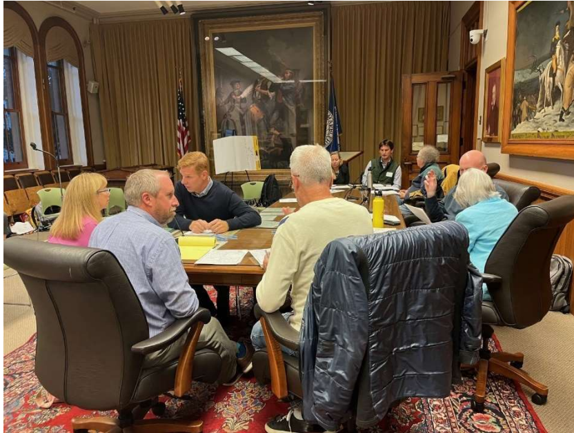
Members of the Green Marblehead Implementation Committee and the Old & Historic Districts Commission discuss clean energy retrofits.

Committee to discuss clean energy retrofits in the town's historic districts. During this collaborative meeting, both groups engaged in thoughtful discussions, working to better understand each other's perspectives. By sharing insights and concerns, the session aimed to build mutual awareness of the challenges and opportunities surrounding the integration of sustainable energy solutions while preserving Marblehead's historic character. This foundational dialogue set the stage for developing cohesive guidelines that balance clean energy advancements with historic preservation.