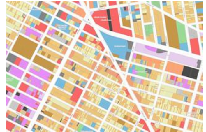
Inclusionary Zoning Policy Creation