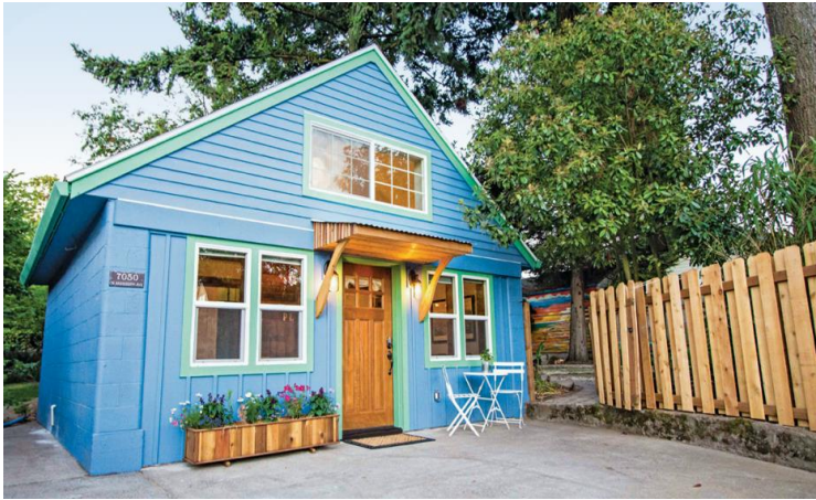
ADU Zoning Creation and Education