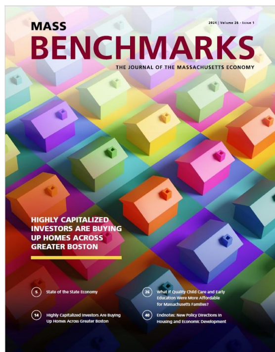
Cover story: MAPC’s Homes for Profit report in the summer 2024 issue of MassBenchmarks