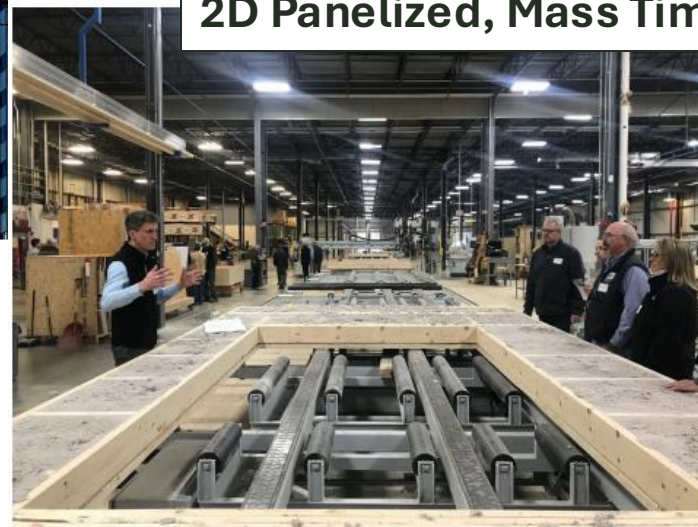
2D Panelized, Mass Timber