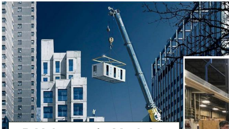
3D Volumetric Modular